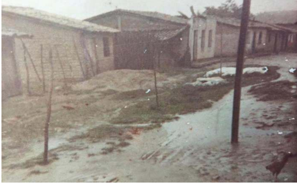
Image 4: The view outside Charles's shack in Maricá favela in 1968.