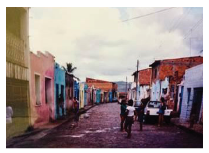
Image12: Charles's street in 2003.

By 1978, even though Peace Corps had ended its presence in Brazil, Maricá had undergone notable infrastructure changes including paved streets and electrical transmission lines, and other improvements.