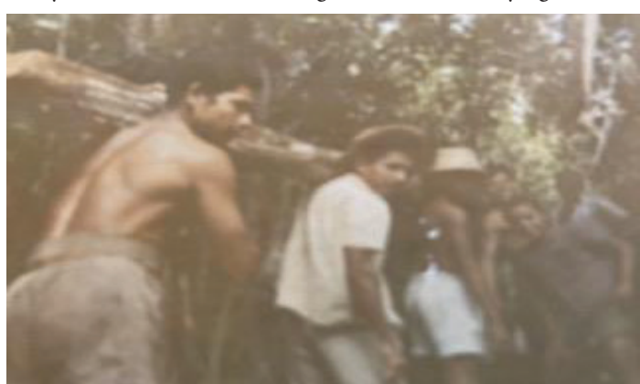
Image 9 : Members of the Bolivia association cutting down trees to show Valença's mayor that they were serious about sharing the cost of electrifying their community

But these seemingly innocuous programs did not sit well with local authorities, and especially with Santo Amaro's police chief and Valença's mayor.